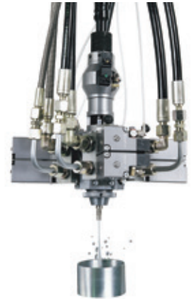
Basis equipment: MK 400 with high-pressure water rinsing system

The DM 402/403 is a 2- or multi-component high-performance low pressure semi- or fully-automatic mixing and dosing system for gasket, gluing and potting applications of different types of parts. The DM 402/403 precisely processes liquid, medium to high viscose media such as polyurethane, silicones, epoxy resins and other polymer reaction substances.