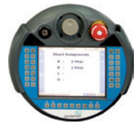
Basis equipment: Multifunctional Mobile Panel (6,5")

Sonderhoff system owners are already prepared for tomorrow's tasks as Sonderhoff systems are able to handle different parts with new geometries and material even under changing circumstances. The 3 component version DM 403 makes it possible to process different materials simultaneously. This futureoriented technology is adaptable to all Sonderhoff precision mixing heads. Whatever the use is – either as a module in a fully automated production line or as a stand-alone system – the DM 402/403 can be integrated into any production concept.