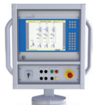
Optionally available: operator panel „Sonderhoff-CONTROL II“ (15")

The precision mixing head MK 400 is part of the basis equipment, optionally the further developed precision mixing head MK 600 can be used. Both mixing heads use the high-pressure water rinsing system, the cleaning technology for mixing chambers patented by Sonderhoff, which results in a series of additional benefits, mainly with regard to quality and efficiency. The nucleation air measuring and control device „LBM-3“ is responsible for keeping the material component's quality constant. In combination with the pressure-controlled recirculation-valve technology a precise material output will be effected. The "Stop-Drop-DVS-3" mixing chamber shut-off device allows an accurate dimension of gasket particularly in the coupling areas. The control system of the DM 403 uses a future-oriented industry PC technology with a real-time operating and bus system. Due to this system, no mechanical parts like hard discs or fans are required anymore. All system and program data are stored on "compact flash" cards. The networking and connection of external equipment can be carried out without previous parameterisation (plug & play). Onboard and remote diagnosis by modem or TCP/IP makes our service available all over the world. Modular design, innovative technology and process-reliable sequences will promote the efficiency of your investment.