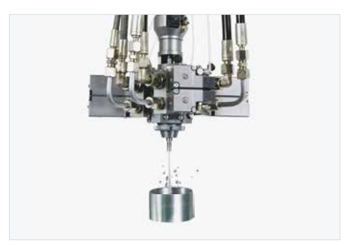
SONDERHOFF MK 400 with high-pressure water rinsing