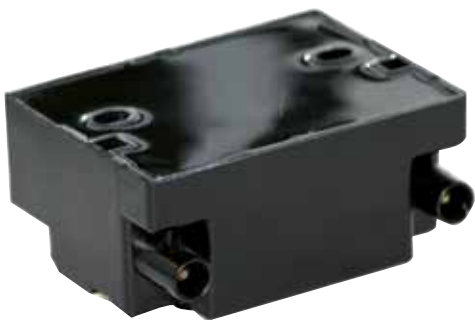
Potting of an electronic component used to control a heating unit

Sonderhoff can exploit the experience gained from more than 500 FERMADUR® formulations.