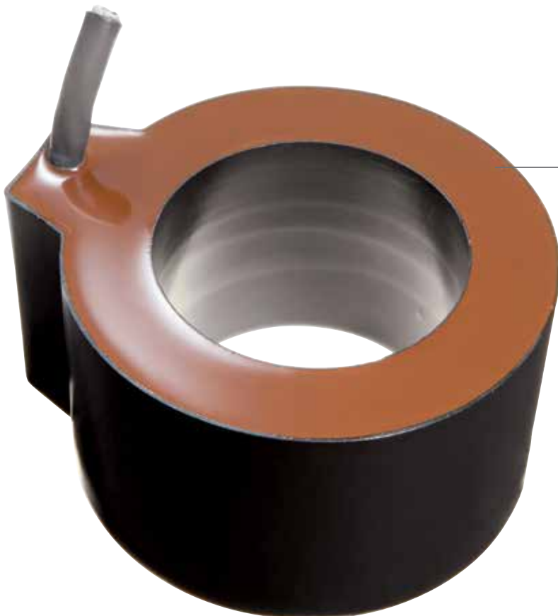
Potting of a transformer using FERMADUR®