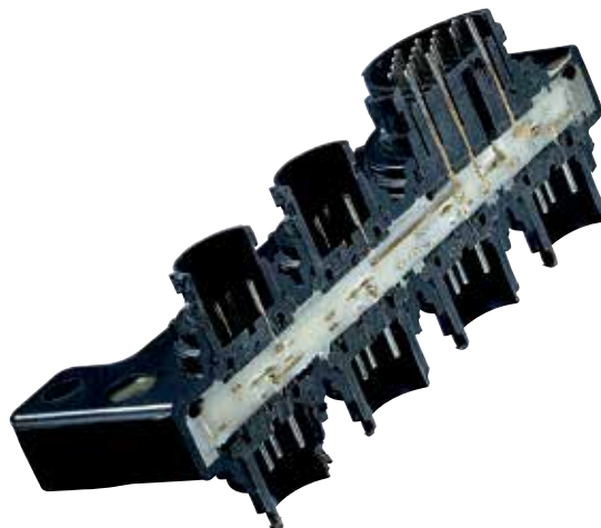
Potting of an automotive connector plug