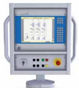
Optionally available: operator panel „Sonderhoff-CONTROL II“ (15")

The precision mixing head MK 400 is part of the basis equipment, optionally the further developed precision mixing head MK 600 can be used. Both mixing heads use the high-pressure water rinsing system, the cleaning technology for mixing chambers patented by Sonderhoff, which results in a series of additional benefits, mainly with regard to quality and efficiency. The nucleation air measuring and control device „LBM-3“ is responsible for keeping the material component's quality constant. In combination with the pressure-controlled recirculation-valve technology a precise material output will be effected. The "Stop-Drop-DVS-3" mixing chamber shut-off device allows an accurate dimension of gasket particularly in the coupling areas. The control system of the DM 403 uses a future-oriented industry PC technology with a real-time operating and bus system. Due to this system, no mechanical parts like hard discs or fans are required anymore. All system and program data are stored on "compact flash" cards. The networking and connection of external equipment can be carried out without previous parameterisation (plug & play). Onboard and remote diagnosis by modem or TCP/IP makes our service available all over the world. Modular design, innovative technology and process-reliable sequences will promote the efficiency of your investment.