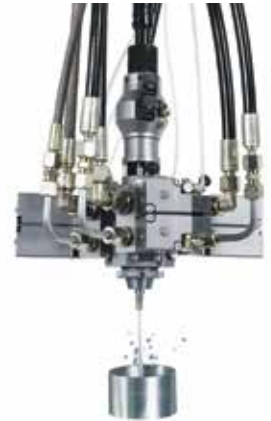
Basis equipment: MK 400 with high-pressure water rinsing system

The DM 402/403 is a 2- or multi-component high-performance low pressure semi- or fully-automatic mixing and dosing system for gasket, gluing and potting applications of different types of parts. The DM 402/403 precisely processes liquid, medium to high viscose media such as polyurethane, silicones, epoxy resins and other polymer reaction substances.