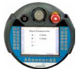
Basis equipment: Multifunctional Mobile Panel (6,5")

Sonderhoff system owners are already prepared for tomorrow's tasks as Sonderhoff systems are able to handle different parts with new geometries and material even under changing circumstances. The 3 component version DM 403 makes it possible to process different materials simultaneously. This futureoriented technology is adaptable to all Sonderhoff precision mixing heads. Whatever the use is – either as a module in a fully automated production line or as a stand-alone system – the DM 402/403 can be integrated into any production concept.