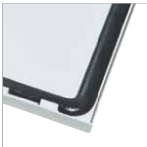
FERMASIL® for enclosures

Sonderhoff FERMASIL® Systems can be used at a constant temperature from -60°C up to +180°C and temporary up to +350°C maintaining their softness and flexibility. Due to their closed cell structure they do not absorb water and are suitable for the use in tropic or damp environment. They are also highly resistant to other chemicals (e.g. commercial cleaning agents, alcohols, diluted acids and lyes, brake fluids, oil and lubricants, cooling agents).