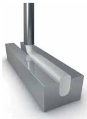
2D application in a groove

Thixotropic (pasty) sealing systems are preferentially used which, depending on the degree of viscosity, form a seal body with a height/width ratio from 1 : 2,5 to 1 : 1,5.