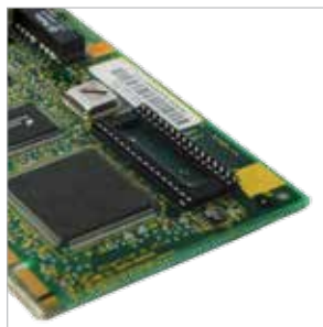
FERMASIL® for electronics