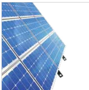
FERMASIL® for photovoltaics