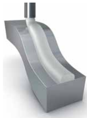
3D application on a surface

Fluid sealing systems, which are self-levelling over joints, are usually used for seal channels. This allows seamless seals.