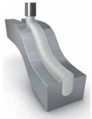
3D application in a groove

Thixotropic (pasty) sealing systems are preferentially used which, depending on the degree of viscosity, form a seal body with a height/width ratio from 1 : 2,5 to 1 : 1,5. Use is possible even with extreme slopes up to vertical surfaces.