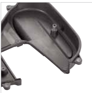
FERMASIL® for automotives