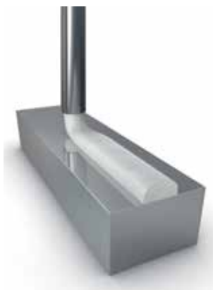
2D application on a level surface

Thixotropic (pasty) sealing systems are preferentially used which, depending on the degree of viscosity, form a seal body with a height/width ratio from 1 : 2,5 to 1 : 1,5.