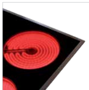
FERMASIL® for white goods