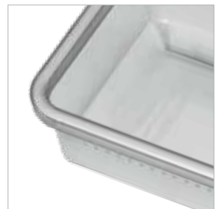
FERMASIL® for lighting