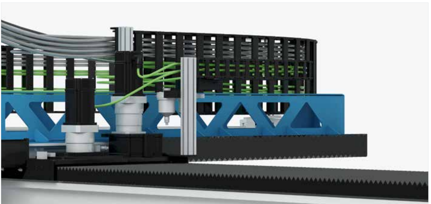
3-axis linear robot SONDERHOFF LR-HD with toothed-rack drive