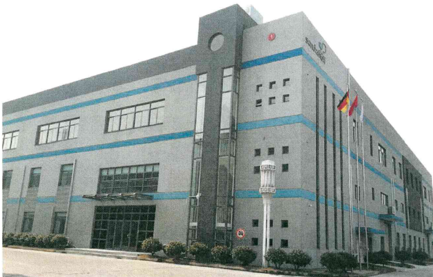
At the location of Sonderhoff (Suzhou) Sealing Systems Co. Ltd. in Suzhou's Singapore Industrial Park (SIP), contract manufacturing can grow even further.

Thanks to its own polyurethane material production for foam gaskets, adhesives and potting, Sonderhoff can plan very flexibly and deliver it to cus-