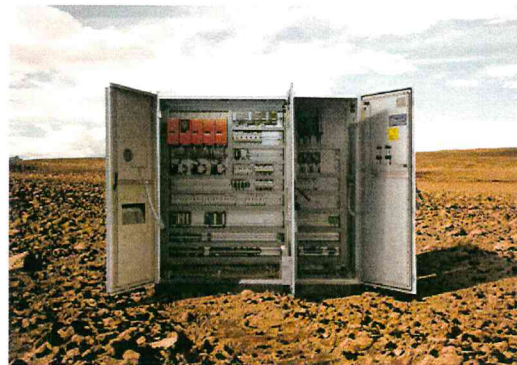
Fast-Cure foam seals from Sonderhoff help protect the interior of switching cabinets from dirt, dust and moisture

The Fast-Cure foam seals for switching cabinets are water-repellent and therefore, can be specially used outdoor. The water uptake in their compressed state at room temperature is less than around 3 % for outdoor foam seals and around 5 % for indoor foam seals. This means that protection classes up to IP 67 can be achieved, depending on the component design and the foam system used. One of the mayor reasons using fast curing foam seals are the cost savings. The customer does not need to invest in tempering furnaces for foam curing. Thus no energy costs occur and only short conveyor belts are needed for the curing.