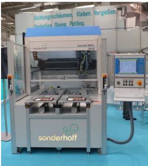
Dispensing Cell SMART-L / DM 403 with thin layer degassing

The transparent or opaque LED potting systems Fermadur® from Sonderhoff do not become yellow after a time. For, using aliphatic isocyanate they are highly resistant against ultraviolet radiation and therefore have a very good light transmission of up to 89%. Unlike plastics, as for instance PC, PS or SAN, Fermadur® clear potting compounds have the resiliency to return to their original undamaged condition by a "self-healing effect" on scratches and cracks which occur under mechanical load. Thus, the transparent LED potting retains its constant light transmission this technology is also suitable for demanding surface coating applications.