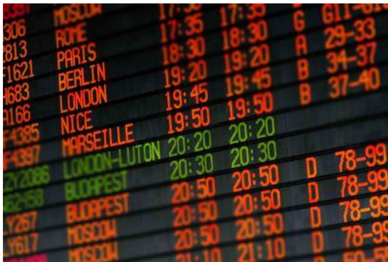
LED information panels

The Sonderhoff group of companies exhibits at Fakuma 2015, October 13-17 in Friedrichshafen, booth A5-5109 / hall A5