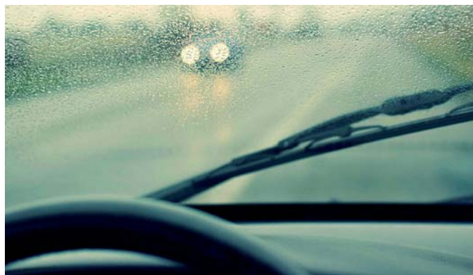
Volatile organic compounds in the air can lead to a fogging effect on windscreens or the inside of headlights.

The emissions values were determined by independent institutions according to the norms VDA 278 in connection with thermo